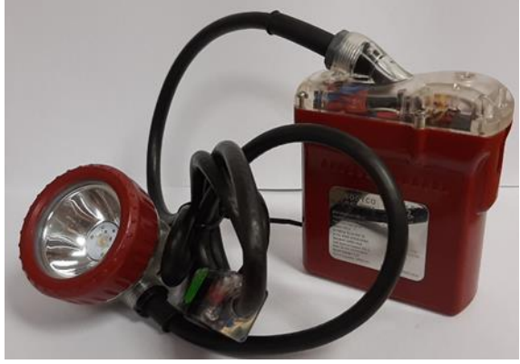
Figure 3: Booyco Cap Lamp

To ensure that the Cap Lamp is functioning correctly, the Lamp Room Verification Unit For Pedestrian Tag is used to verify the Cap Lamp. The Camp Lamp indicates the verification procedure on its indication LED's, Camp lamp shown in Figure 3.