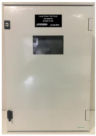
Figure 1: Lamp Room Verification Unit for Pedestrian Tag

There are several main functional components in addition to the Lamp Room Verification Unit for Pedestrian Tag that ensures the verification of Pocket Tags can be done. Figure 1 shows the Lamp Room Verification Unit for Pedestrian Tag