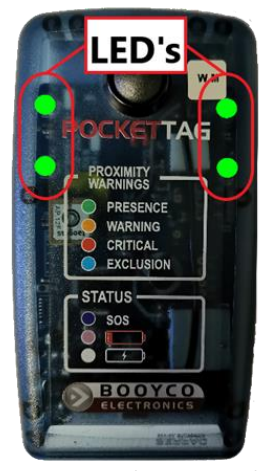
Figure 2: Pocket Tag LED location

To ensure that the Pocket Tag is functioning correctly, the Lamp Room Verification Unit for Pedestrian Tag has used to verify the pocket tag. The pocket tag indicates the verification process on its indication LED's shown in Figure 2.